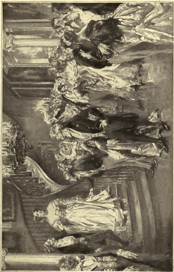
But it was the Colonel who took possession of her when she reached the floor of the great hall